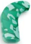
Green Camo Z206760