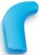
Freedom Blue Z206752