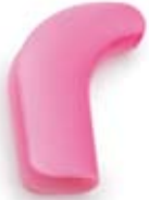
Freedom Pink Z206751