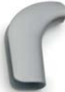
Freedom Silver Z206753