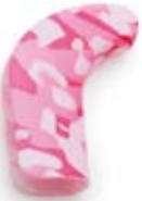
Pink Camo Z206759